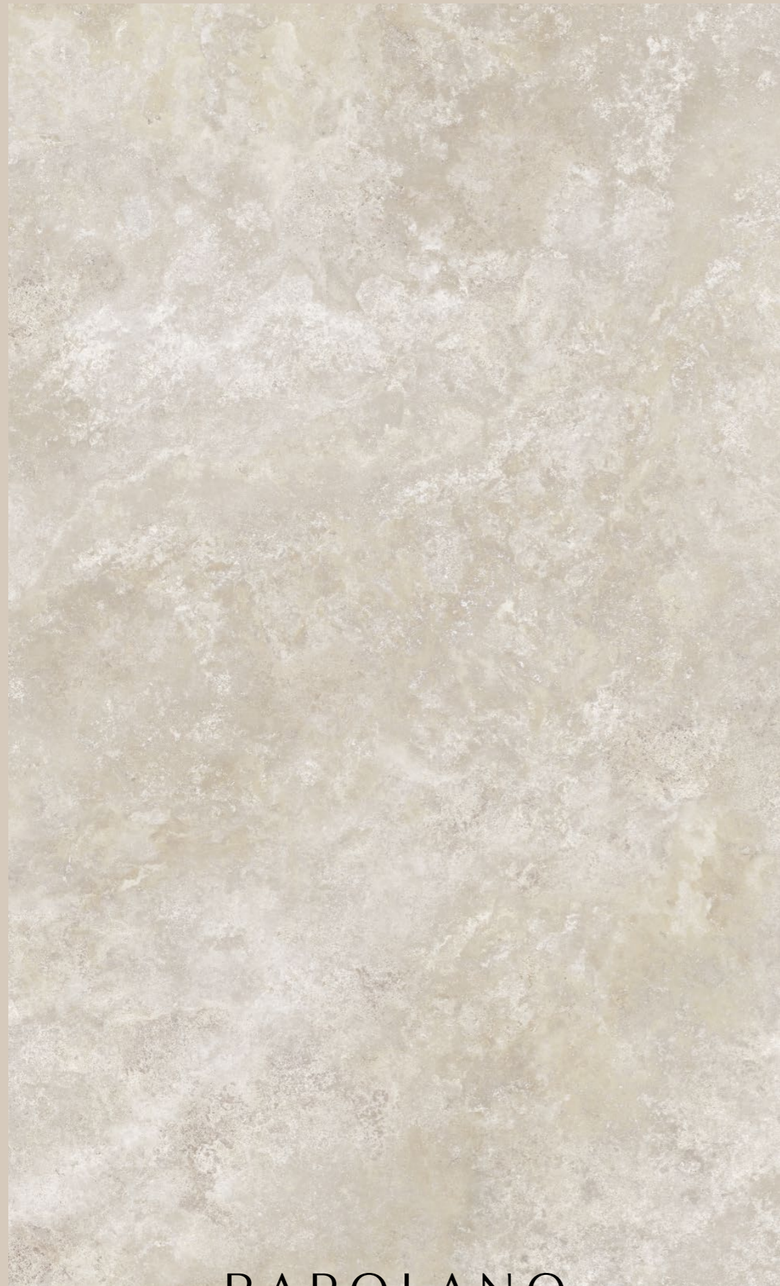
RAPOLANO Timeless elegance